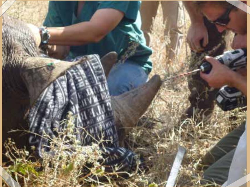
A ranger drilling into the horn of a sedated rhino to insert a microchip