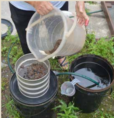
ukugeza nokuhlunga inhlabathi wasendulo

Ngendlela efana nale owenze ngayo, abavubukuli nabo baqoqa, bageze futhi basefe inhlabathi ukuze bafune izimbewu kanye nezinsalela zezitshalo emigedeni kanye nasezindaweni okuvubukulwa kuzo.