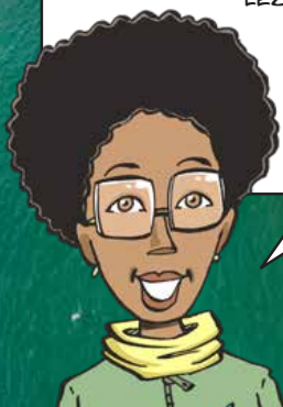
EmaMpondweni, lapho okwakuhlala khona abantu basendulo eminyakeni engu-10 000 edule

ISIFUNDA SASEMAMPONDWENI ESIGUDLE UGU OLUSEMPUMALANGA YENINGIMU AFRIKA SIYIKHAYA LEZITSHALO EZININGI KANYE NEZIMBALI. EZININGI ZALEZI ZITSHALO ZIYADLIWA FUTHI ZISASETSHENZISWA AMAMPONDO KANYE NABANYE ABANTU KUZE KUBE NAMUHLA.