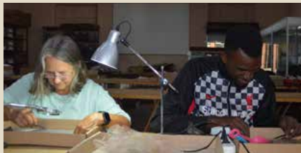
Ukucinga imbewu yasendulo

UbuFakazi basendulo bezitshalo ngokuvamile kunzima ukubuthola ngoba buye badliwa noma babola ngokuhamba kwesikhathi. Ngezinye izikhathi, izinsalela zezitshalo ziyalondolozeka kuye ngesimo sendawo noma inhlabathi, njengasezindaweni ezihlale zimanzi noma ezome kakhulu.