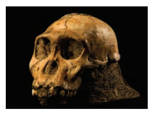
Cranium of the juvenile male nicknamed "Karabo"

He is a recently discovered species of human ancestor and is probably about 1,98 million years old! He was found with 5 others in Malapa Cave at the Cradle of Humankind World Heritage Site in Gauteng, from 2008 onwards.