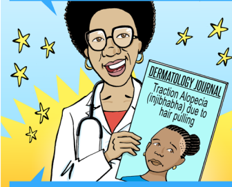
... AND CHANGE THE WAY YOU PART YOUR HAIR EVERY FEW WEEKS TO AVOID PLITTING TOO MUCH STRAIN IN ONE AREA.

RESEARCH SHOWS THAT WEAVING AND BRAIDING CAUSES HAIR LOSS WE RECOMMEND, GO NATURAL.